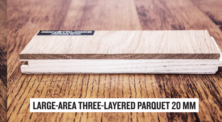
LARGE-AREA THREE-LAYERED PARQUET 20 MM

Single plank, oiled Thickness 15mm, width 180mm Length 700-2150mm Wear layer:4mm Connection: groove and tongue