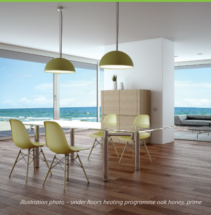
illustration photo – under floors heating programme oak honey, prime