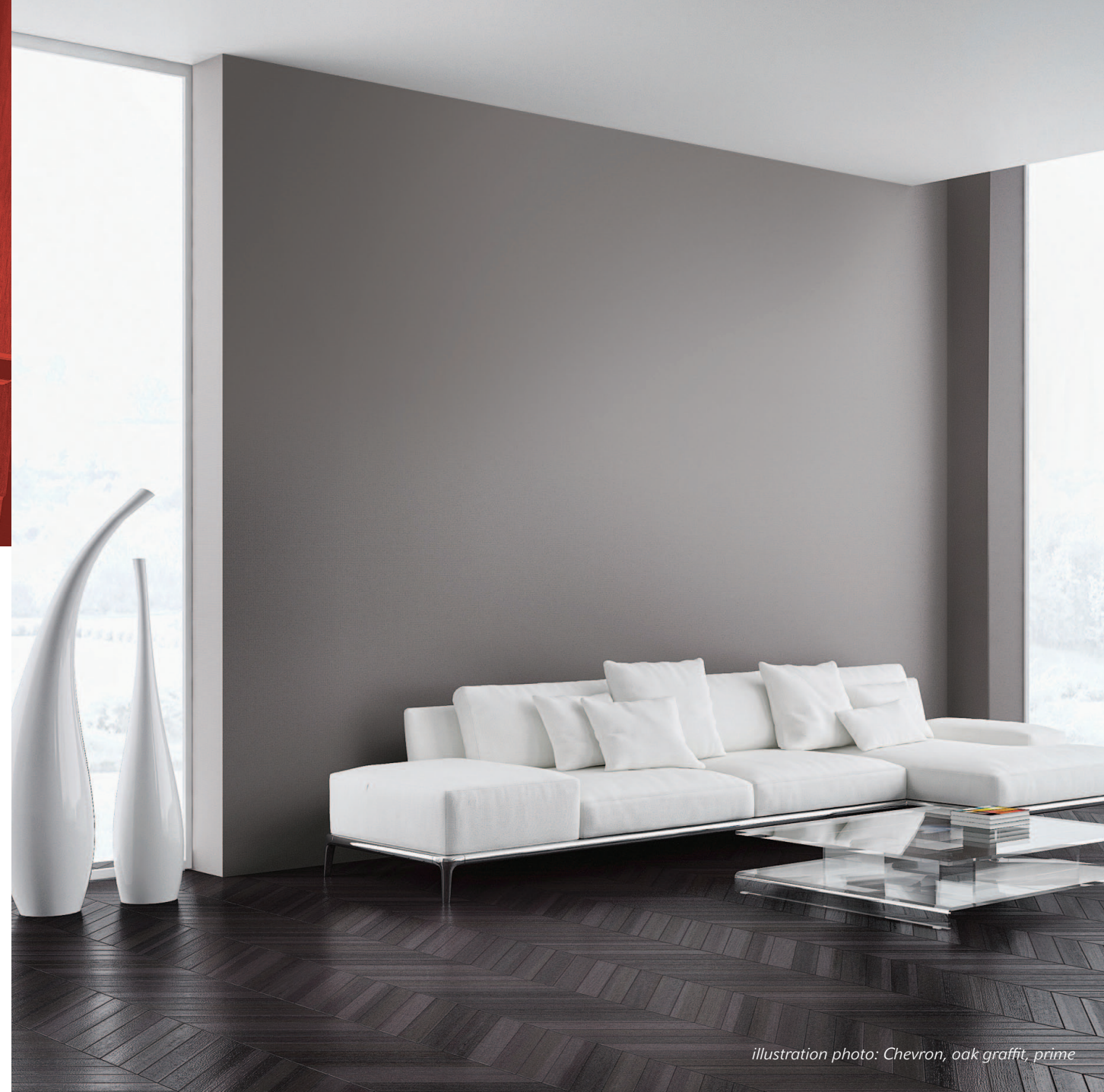
illustration photo: Chevron, oak graffit, prime