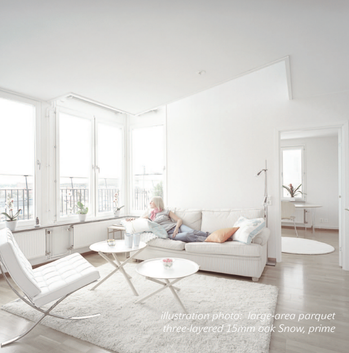
illustration photo: large-area parquet three-layered 15mm oak Snow, prime