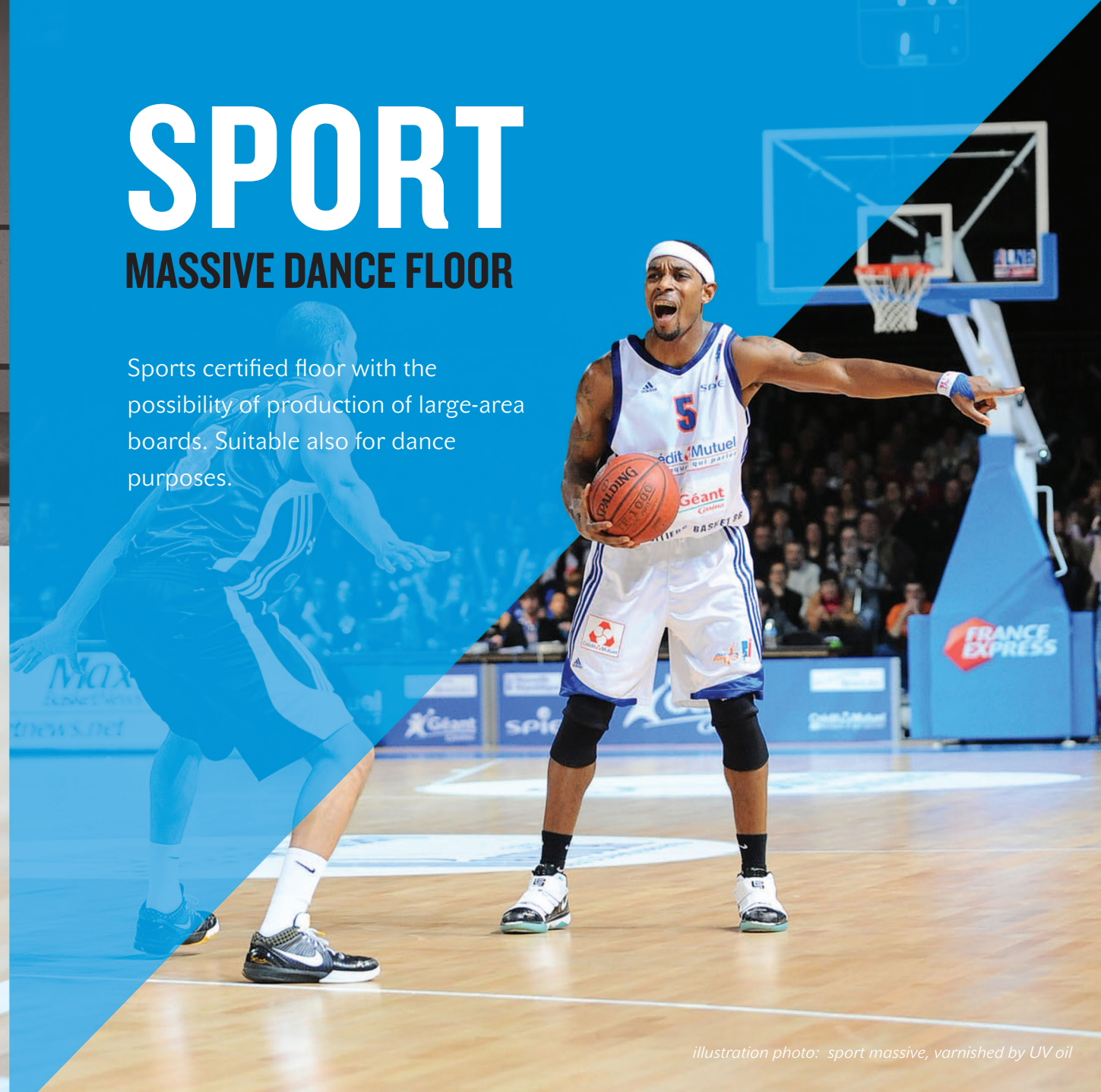
illustration photo: sport massive, varnished by UV oil

Sports certified floor with the possibility of production of large-area boards. Suitable also for dance purposes.