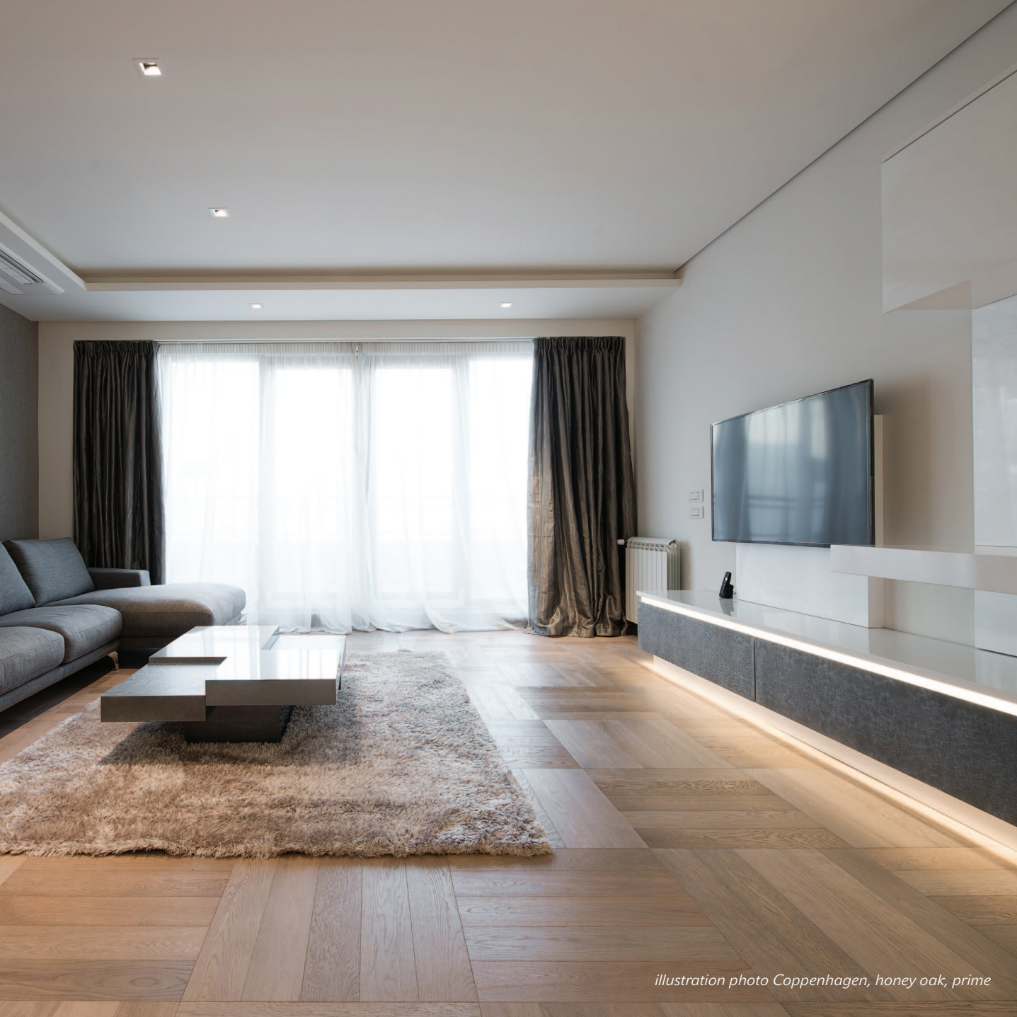
illustration photo Copenhagen, honey oak, prime