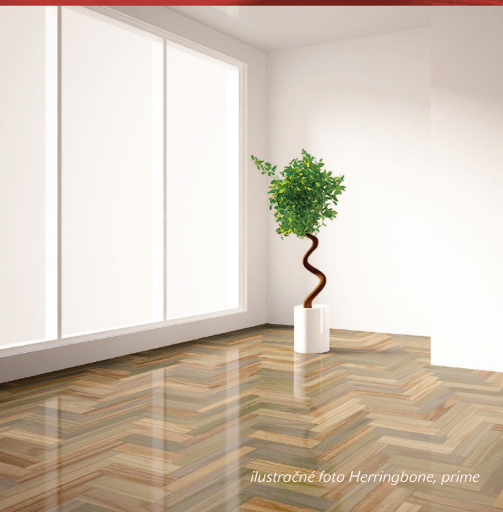
ilustračné foto Herringbone, prime

Suitable for both modern and traditional interiors. This type of floor intensifies the effect of unique harmony of space and furniture in modern interiors and underlines antique and rustic character of classical interiors.