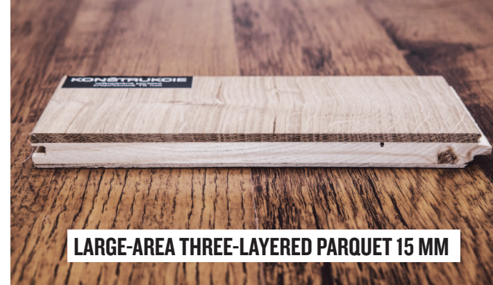
LARGE-AREA THREE-LAYERED PARQUET 15 MM

Single plank, oiled Thickness 15mm, width 180mm Length 700-2150mm Wear layer:4mm Connection: groove and tongue