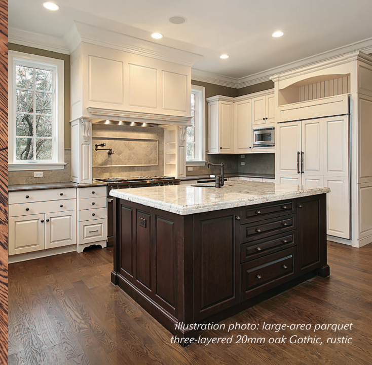
illustration photo: large-area parquet three-layered 20mm oak Gothic, rustic