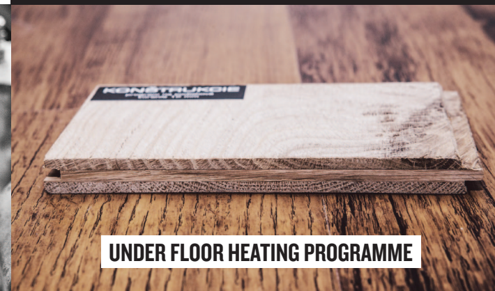
UNDER FLOOR HEATING PROGRAMME

Single plank, oiled Thickness 20mm, width 180mm Length 700-2150mm Wear layer:6mm Connection: groove and tongue