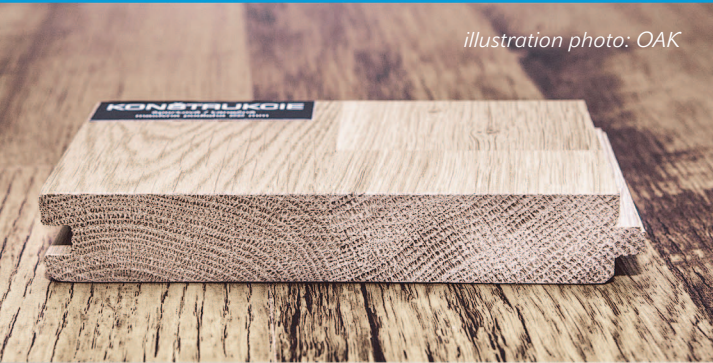
illustration photo: OAK

Thickness 22mm, width 132 mm, length 2400 mm, connection: groove and tongue Varnishing: BEECH - 4 layers/OAK - 5 layers Type of varnish: acrylic UV