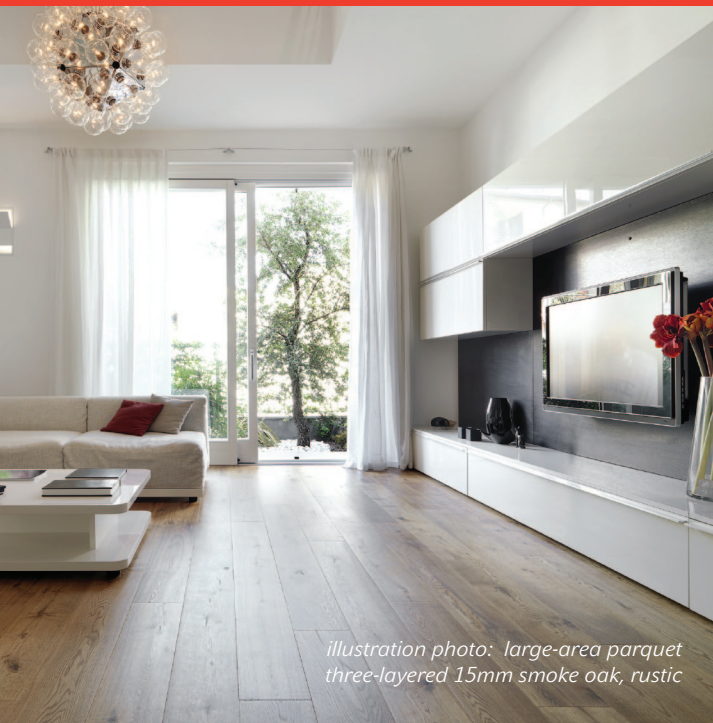
illustration photo: large-area parquet three-layered 15mm smoke oak, rustic

Beauty of wood structure is enhanced by brushing.