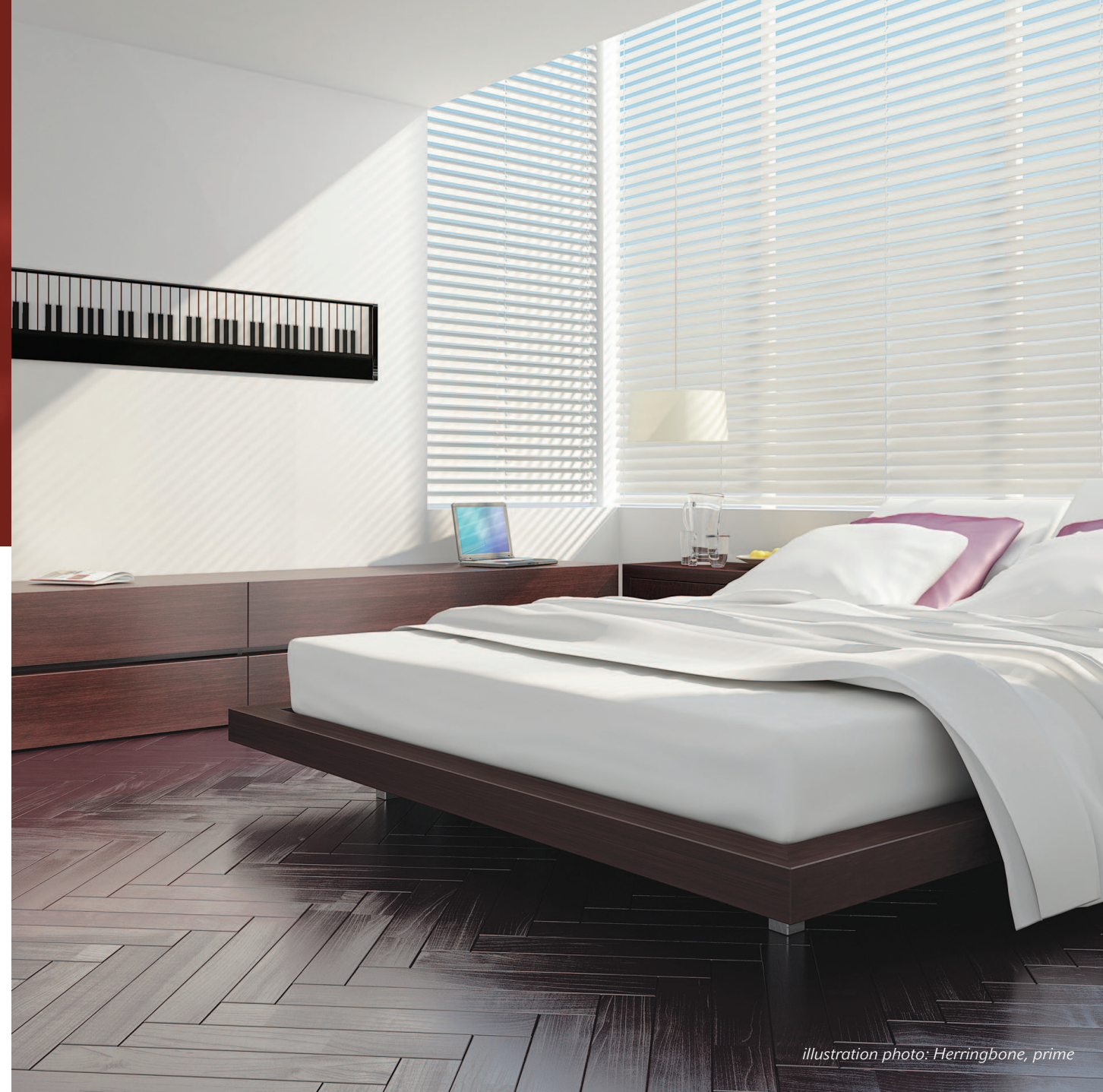
illustration photo: Herringbone, prime